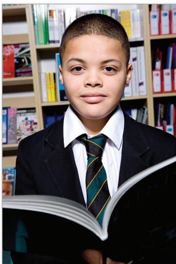
For Technical Advantages PTO